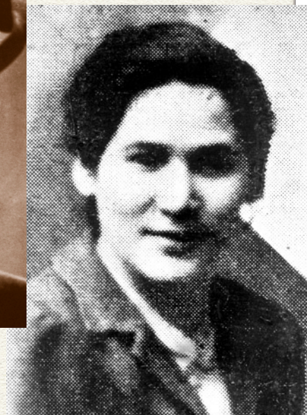
► Roza Robota