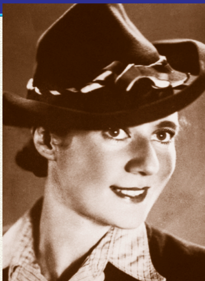
▲ Ella Gartner

Late in 1944, prisoners at Auschwitz revolted, too. Like the escapees at Treblinka and Sobibor, most were caught and killed. Young women like Ella Gartner and Roza Robota made the Auschwitz uprising possible. Gartner smuggled gunpowder into the camp from the munitions factory where she worked. Robota helped organize resistance in the camp. Gartner and Robota were executed on January 6, 1945. Less than a month later, Auschwitz was liberated.